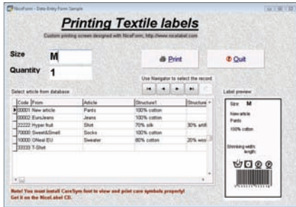
Designing custom data-entry and printing forms