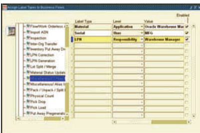
Label printing set-up in the Oracle applications

NiceLabel provides various ActiveX integration opportunities. Label design is performed in the powerful NiceLabel design environment while your custom application prints the label. You can select the type of label template, change the values of variable fields, and print the label from the selected printer. Also, an additional optimized NiceLabel edition, NiceLabel SDK, is available to integrate NiceLabel functionality to any 3 rd party application.